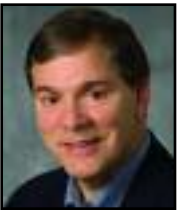
Ken Boa, President Reflections Ministries

In all innocence, children have for centuries sung a nursery rhyme that is in truth anything but an innocent verse: Ring-a-ring o’roses, A pocket full of posies, A-tishoo! A-tishoo! We all fall down!